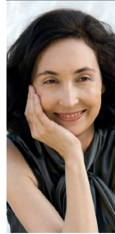
ELSA PUNSET Education & emotional intelligence applied to change expert